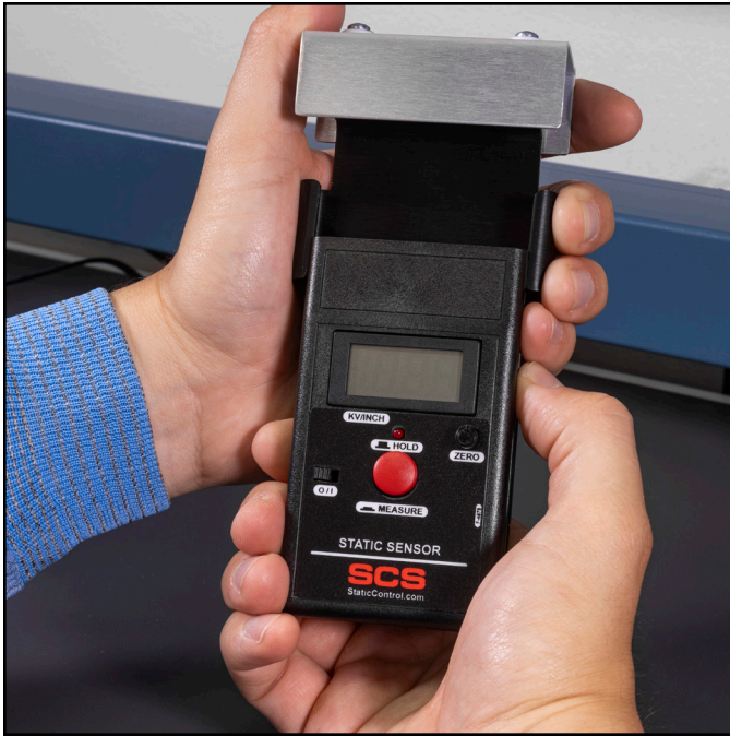
Figure 8. Sliding the Conductive Plate onto the Static Sensor