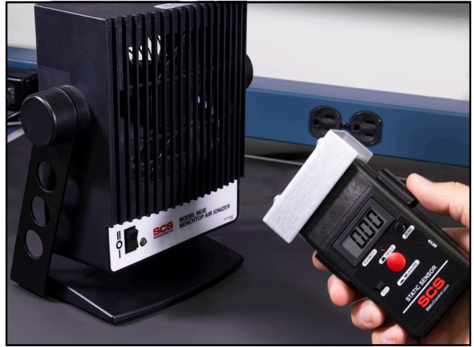
Figure 9. Using the Static Sensor with Conductive Plate to measure the offset voltage of a benchtop ionizer

NOTE: When testing pulsed ionizer systems, the voltage displayed is constantly changing. This pulse rate may be faster than the display update rate of the Static Sensor, therefore the displayed voltage is an average of the actual voltage. The output of the Static Sensor is useful in this situation for more accurate measurements.