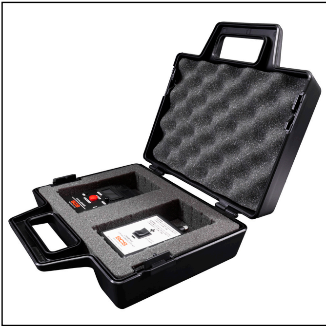
Figure 3. Air Ionizer Test Kit and Carrying Case