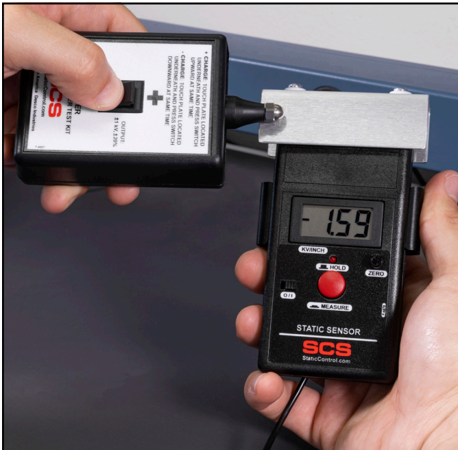
Figure 10. Using the Charger to apply a charge onto the Conductive Plate

NOTE: A ground path must be provided between the touch plate of the Charger and the ground reference of the Static Sensor. This is normally provided by holding the Charger in one hand and the Static Sensor with Conductive Plate in the other.