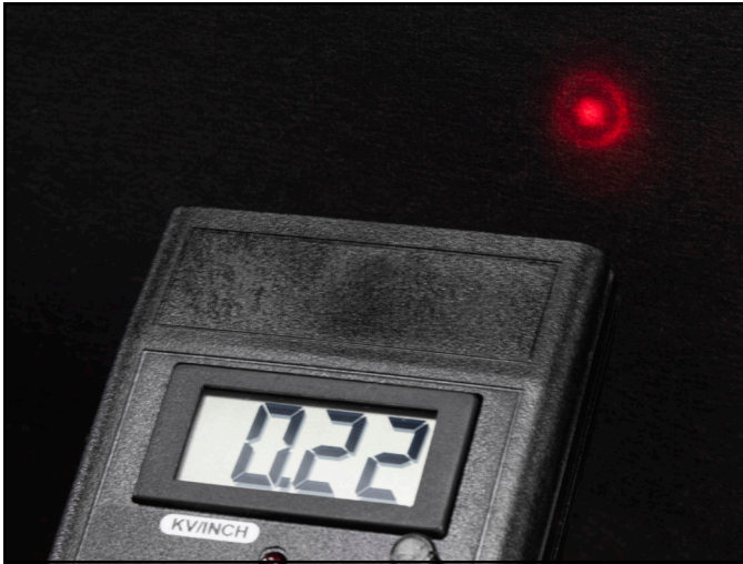
Figure 7. Aligning the two bullseyes emitted by the LED range indicator