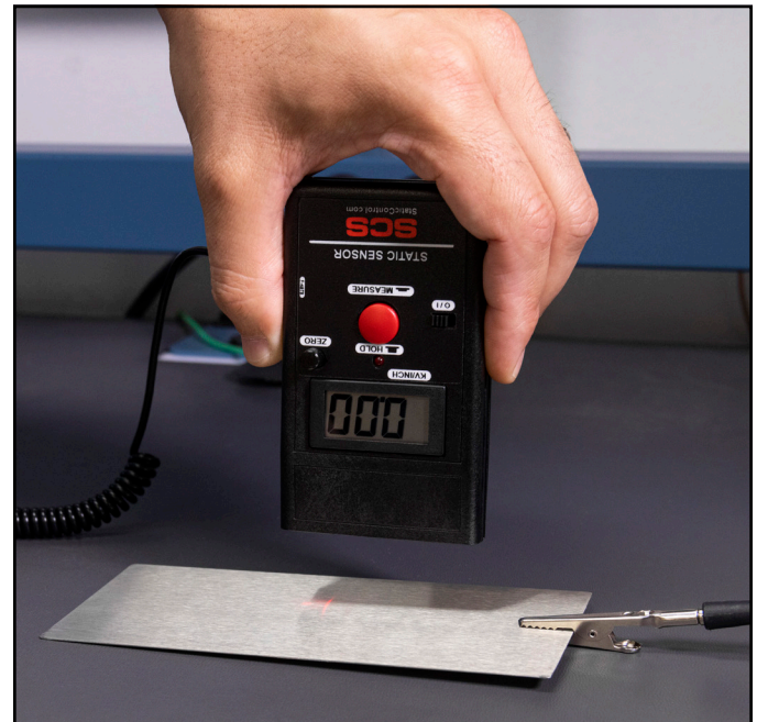
Figure 6. Pointing the Static Sensor to a grounded surface

Slide the power switch to the right to power the Static Sensor. Point the top of the Static Sensor approximately 1 inch (2.5 cm) away from a grounded metal surface. Proper spacing is indicated when the two red bullseyes emitted LED range indicator become centered on top of each other. Turn the rotary zero knob until the Static Sensor's display reads 0.00.